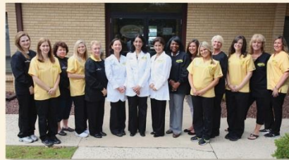
You'll really like the whole dental team. Everyone is so nice, friendly and very experienced.

We pride ourselves on providing quality, comprehensive, smile care—through a full range of pediatric and orthodontic services.